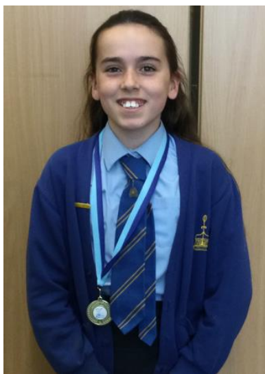
Music of the Week

Well done a wonderful effort. I know we have many children that compete in gymnastics doing very well. Keep it up everyone!