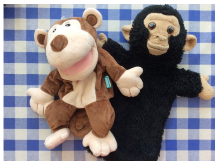
Molly the Monkey and Mojo the Monkey