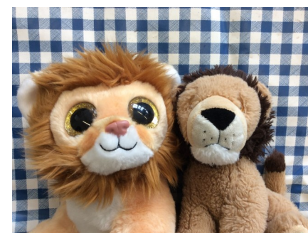
Lenny the Lion and Lola the Lioness

Please remember to send in your WOW moments!