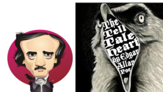
Edgar Allan Poe

Before reading any of his texts, Year 6 will investigate the man himself – Edgar Allan Poe. What was it about his life that led him to produce such dark, strange and mournful writing? We will then study The Raven and The Tell-Tale Heart before composing spooky and suspenseful tales of our own.