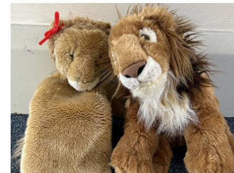
Luke the Lion and Lucy the Lioness

Please remember to send in your WOW moments!