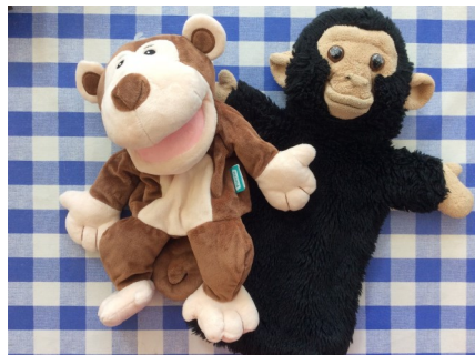
Molly the Monkey and Mojo the Monkey